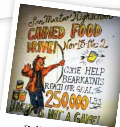
San Mateo High School