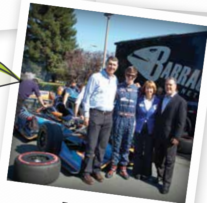
Food Bank 500