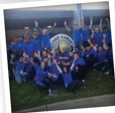
EMC Group Fun