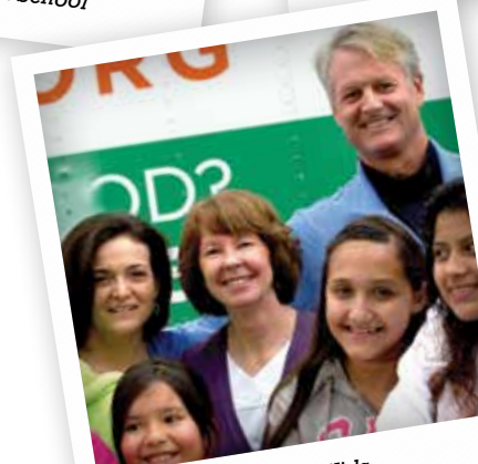
Stand Up for Kids Campaign Co-Chairs