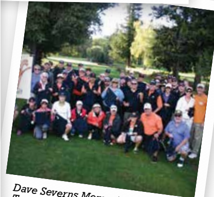
Dave Severns Memorial Golf Tournament