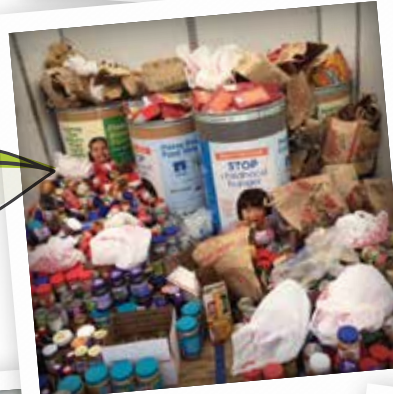
Monta Vista High School