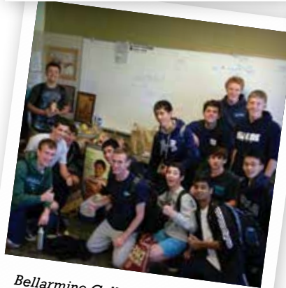
Bellarmine College Preparatory