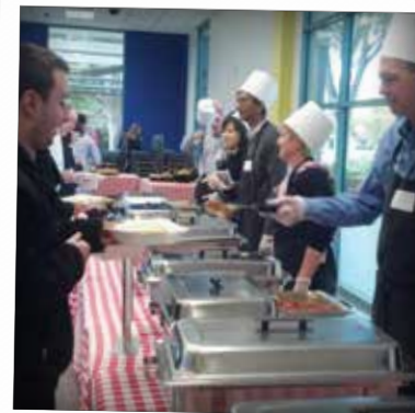
Applied Materials Executive Chef