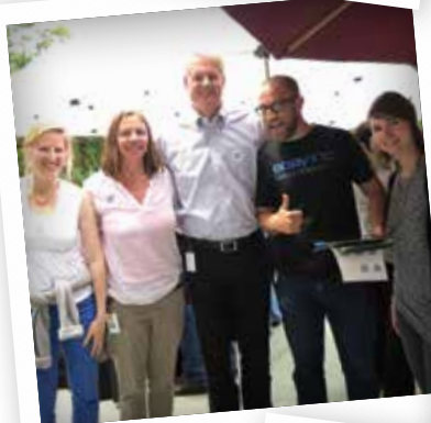
eBay team with John Donahoe