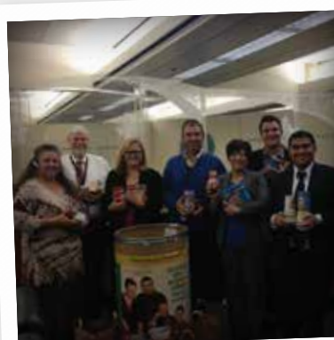
Santa Clara County Board of Supervisors