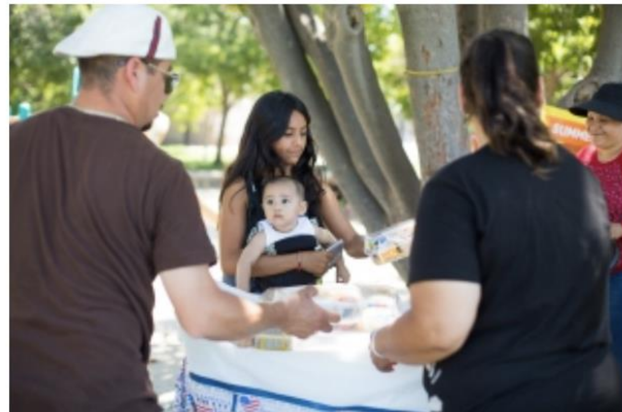
Kids pick up free lunches during the summer lunch program at Rengstorff Park on June 22. By providing food at more locations in the city, the Mountain View School District's "Seamless Summer" program served far more meals this year than in the previous two years.

The district's "Seamless Summer" program looked a whole lot different this year, extending its operation from six weeks to eight weeks, and using food delivery trucks to expand to Rengstorff and Klein parks as well as the Mountain View Public Library. It ran from June 12 through the first week of August. Children head back to school next week